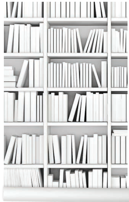
library wall mural $125 for 6 panels, brewsterwallcovering.com