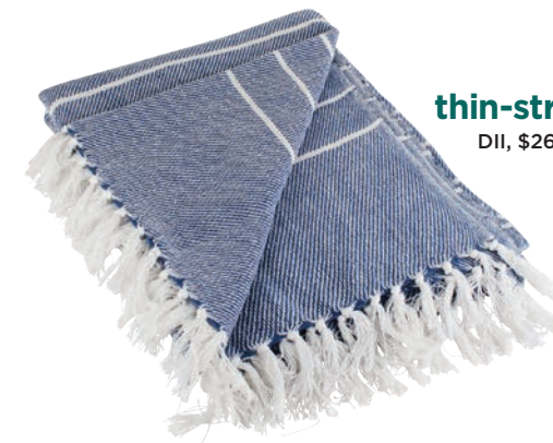
thin-stripe throw DII, $26.50, qvc.com