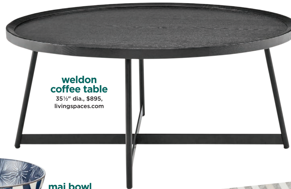
weldon coffee table 35½" dia., $895, livingspaces.com