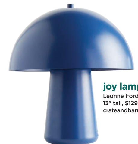
joy lamp Leanne Ford, 13" tall, $129, crateandbarrel.com