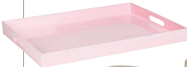
lynea tray Latitude Run, 19", $98, wayfair.com