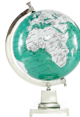
globe $100, wayfair.com