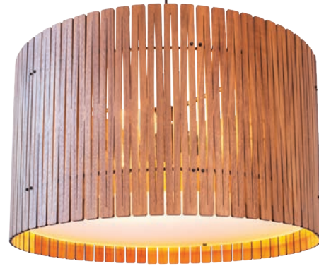
d6 pendant Graypants, 22" dia., $1,300, curatedclt.com