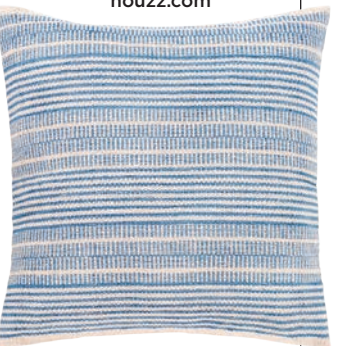
ryder pillow cover Surya, 20", $83, houzz.com