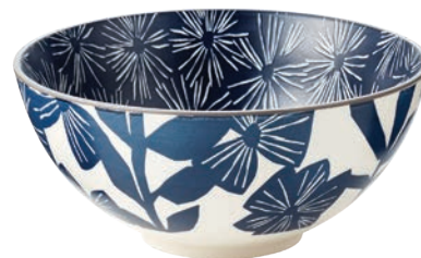
mai bowl 7½" dia., $13, crateandbarrel.com