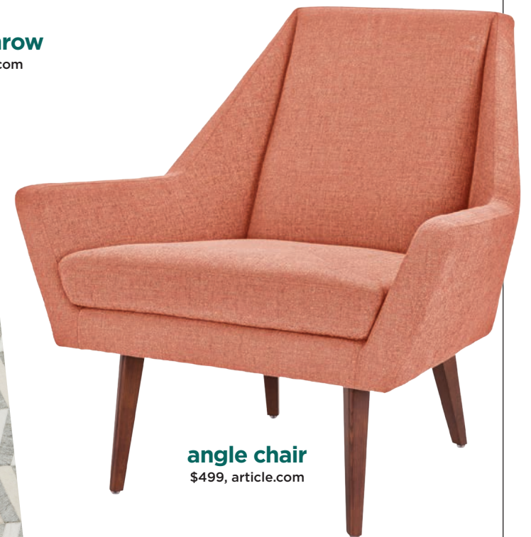
angle chair $499, article.com