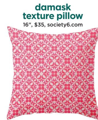
damask texture pillow 16", $35, society6.com