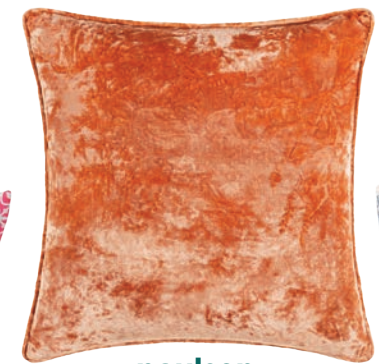
paulsen pillow 18", $106, paynesgray.com