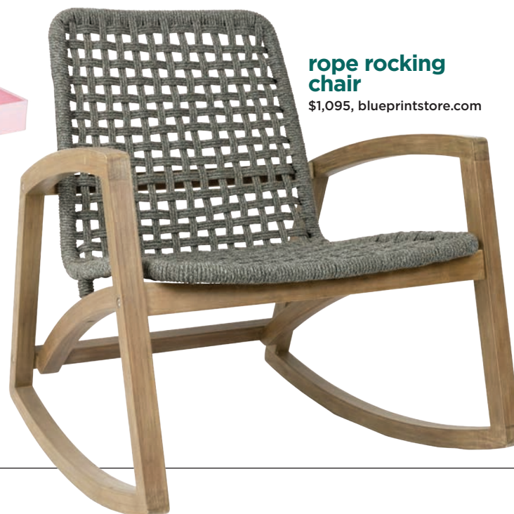
rope rocking chair $1,095, blueprintstore.com