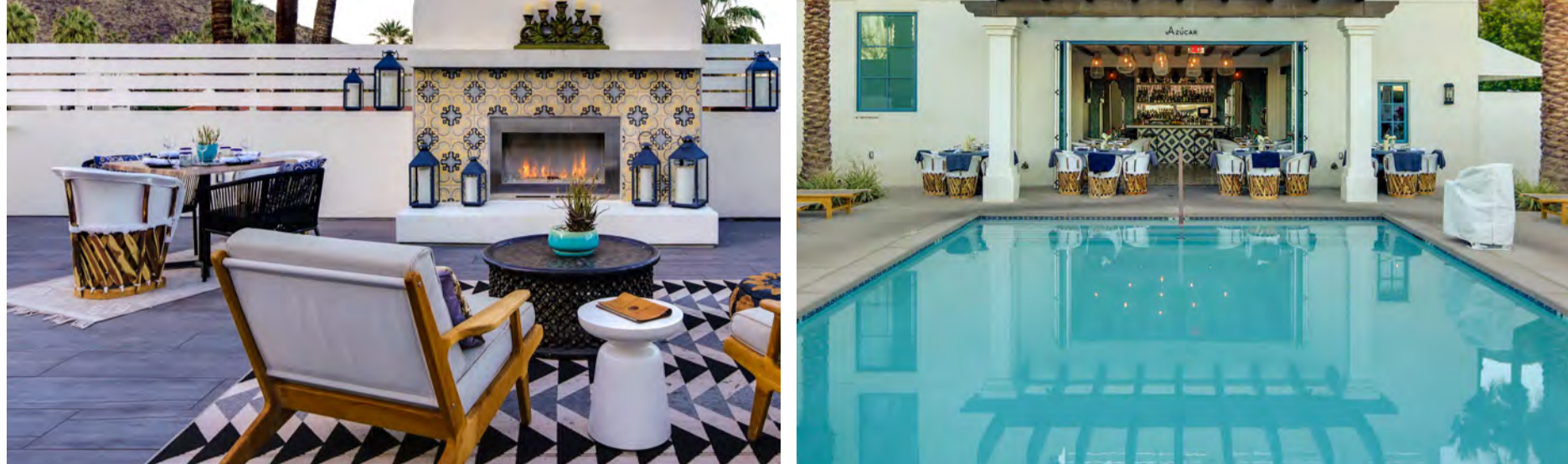
Historic La Serena Villas Hotel in Palm Springs, California